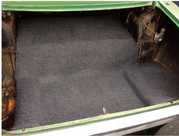
Original Style Charcoal Loop Pile