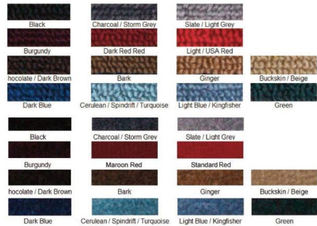
Optional Black Plush Pile