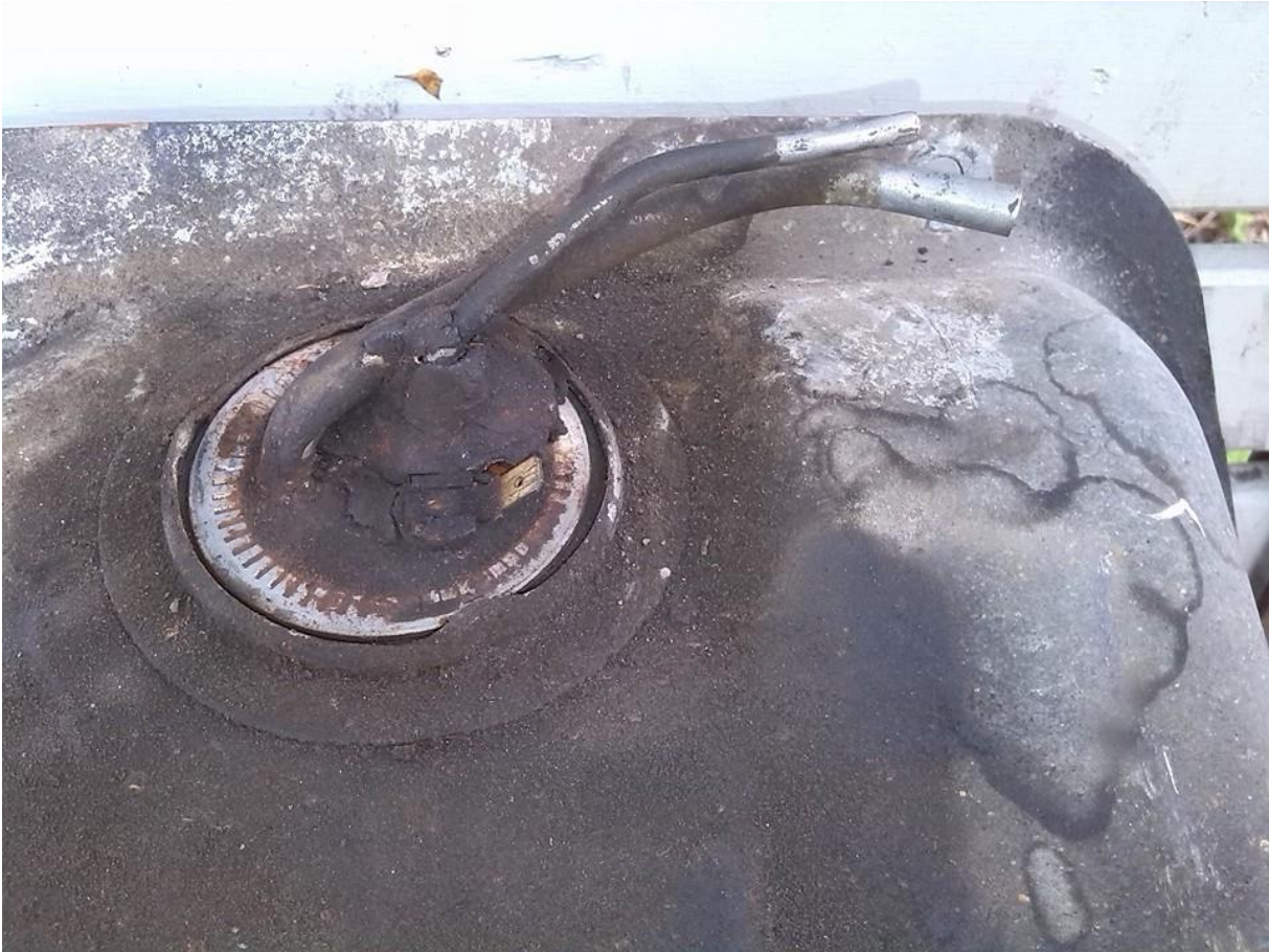
Pulled the sender pick-up unit out of the tank and looked into the tank.