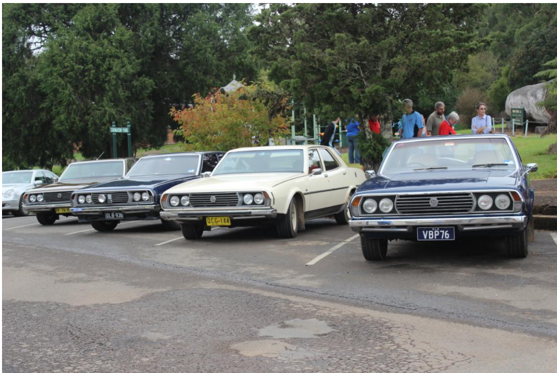
Cars at Dorrigo on Easter trip