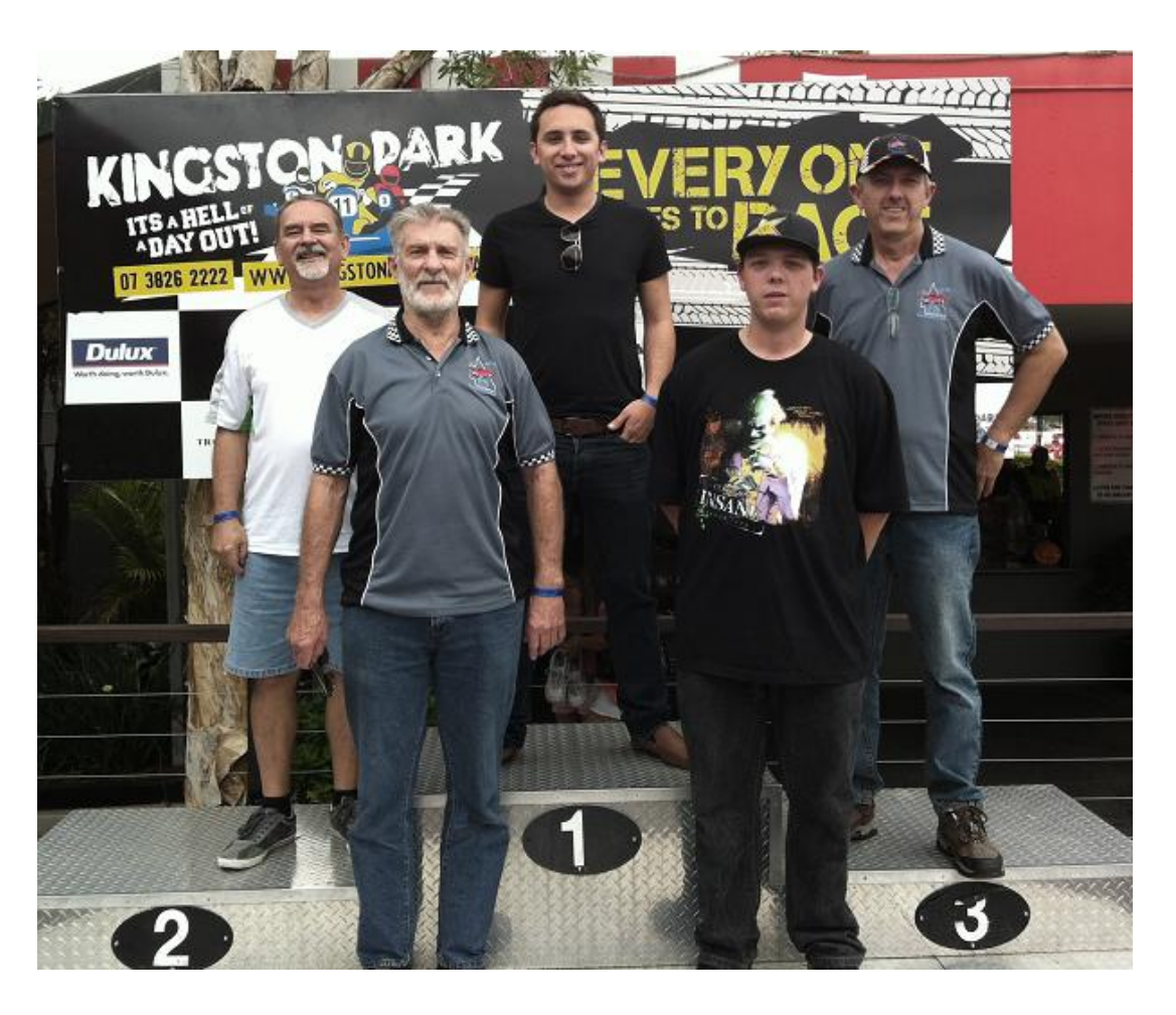
Queensland P76 Kart racing team