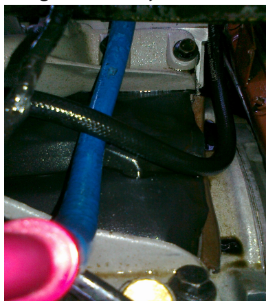
POPPED INTAKE MANIFOLD GASKET AT LAKESIDE