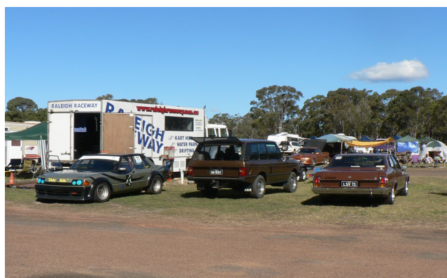
SHANE AND REGS PIT SET UP

After two disappointing runs at Lakeside, one in which excessive smoke was being blown from the exhaust, caused by the pcV valve set up, and the other in which he popped the intake manifold gasket, we didn't know what to expect from the new motor. Between the days at Lakeside and Maryborough I had fitted shift lights to the dash (between the indicators) and Reg had replaced the valley cover and fitted new front brake pads and had the discs machined. We also had ready and waiting if needed a large oil catch can, which I bought from triple eight racing, ready to go in if oil problems eventuated.