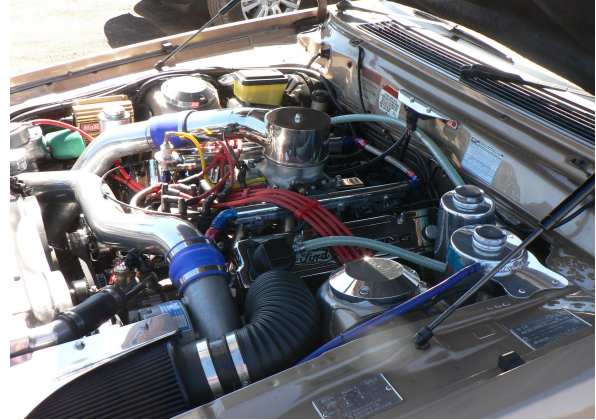
GRAHAM DILLEYS 1981 FORD LTD WITH SUPERCHARGED WINDSOR

Regs P76. There were many nice cars of different types, but the car getting all the cheers every time it finished a lap was the Goggomobile, people just loved to hear the little 2 stroke putter by, with a best time of 78.04 . The Nascar was a bit of a lost cause on the tight short track and could not reach its full potential, with a best time of 58.02.