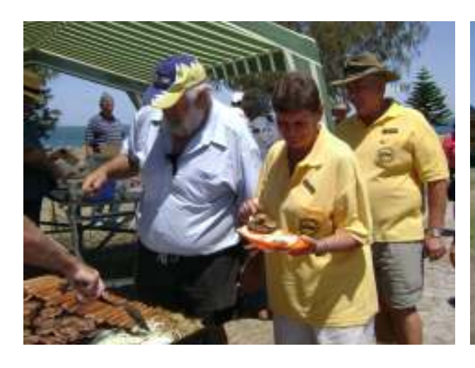
Looks good enough to eat