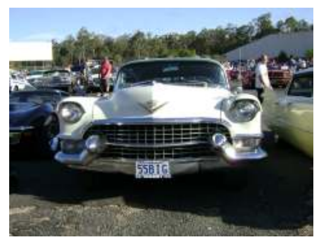
..... a 1955 Cadillac