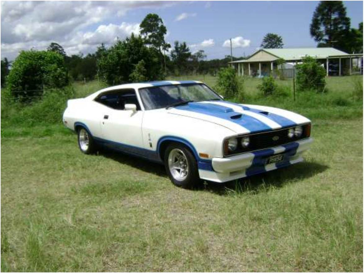
Aussie Muscle Car Musuem – above a Ford Cobra and below Marina coupe