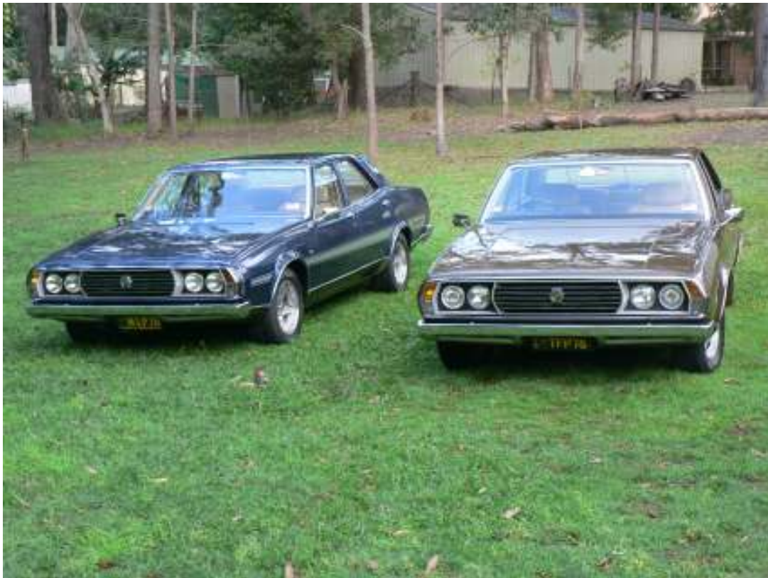
Neville's two Targas – Omega navy (left) and Nutmeg