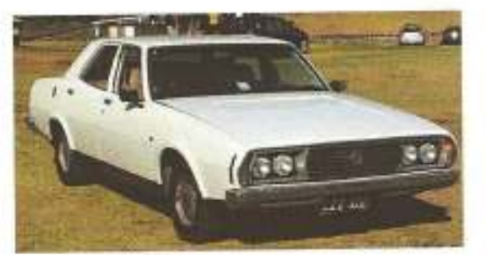
Best L6 (Runner-up)