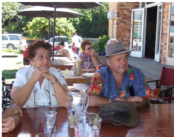
You have our full attention ...