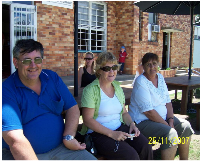
What is a game without an audience to cheer the players on.