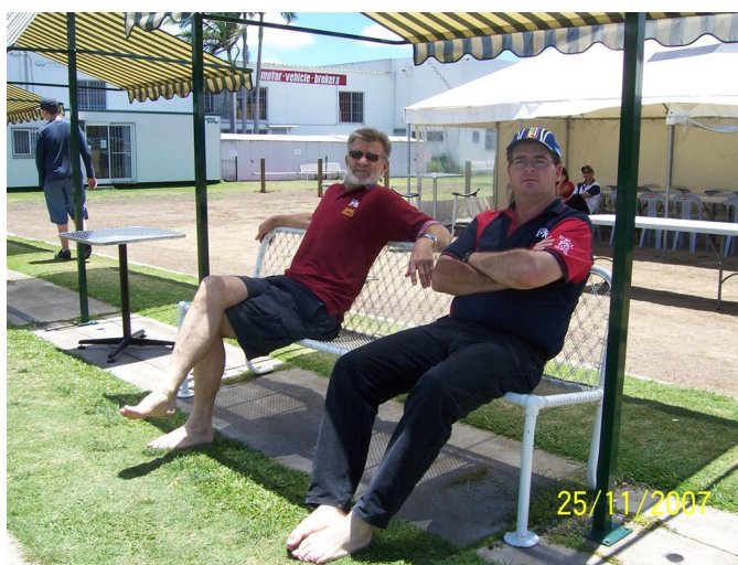
Just resting ... this bowls is not as easy as it looks.