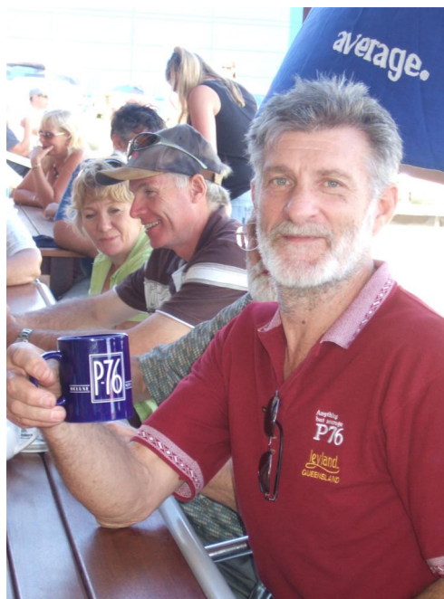
Should I drink out of it?