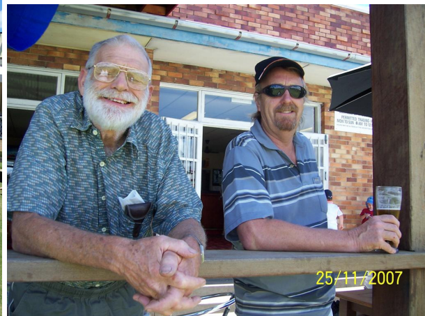
Where else would you want to be?