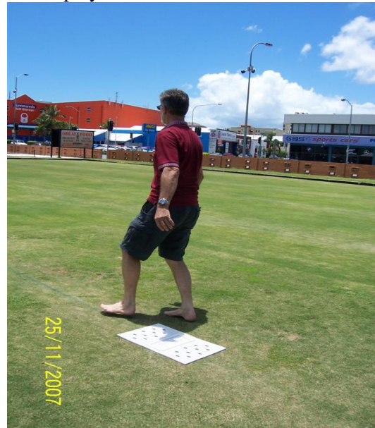
Finally worked out what to do with the mat...