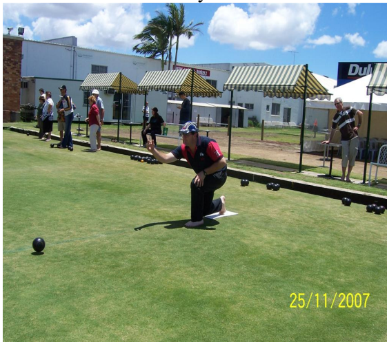
Showing how it is done in style