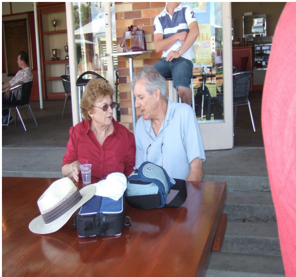
Well done – I knew you could do it