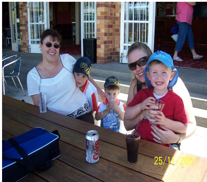
Family day out