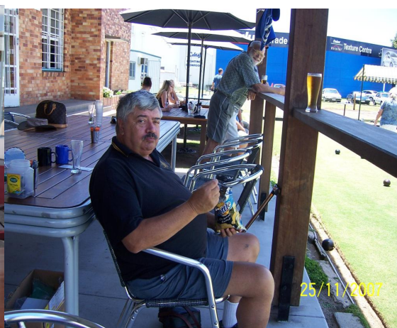
Well, wouldn't you rather be here instead ..