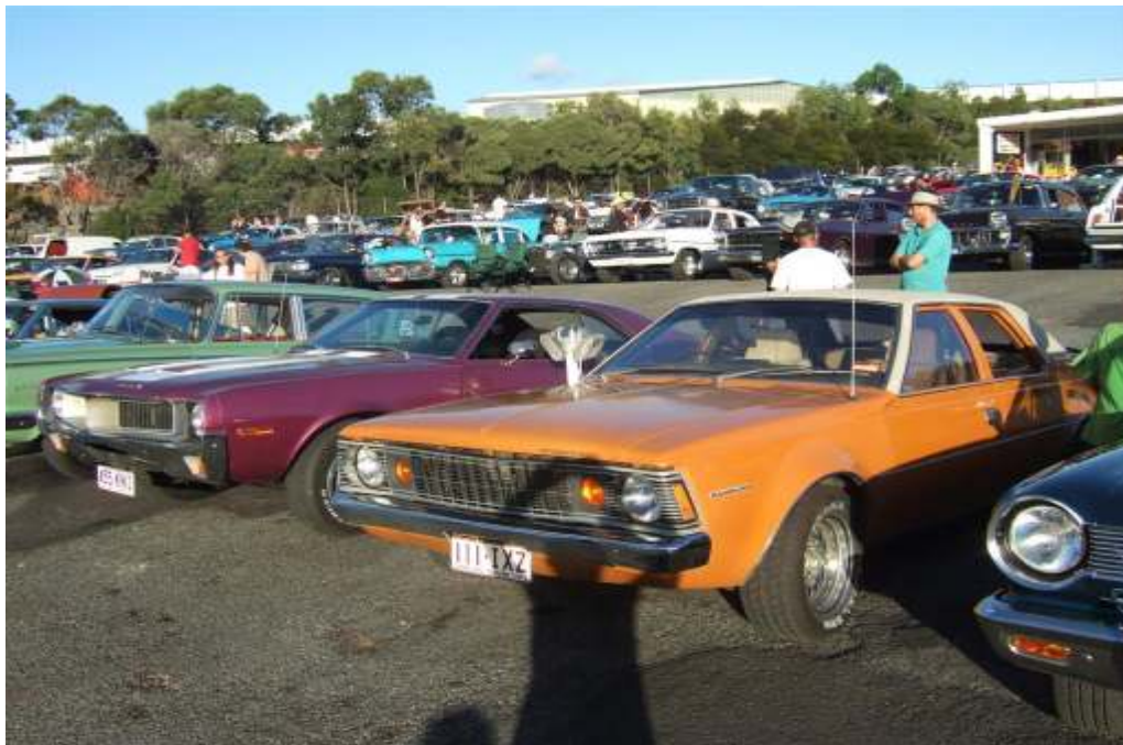
Some of the cars on display