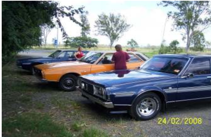
Morning tea stop on way to Marburg

At the end of February three P's went on the club outing to Marburg on a beautiful sunny Queensland day with high temperatures and very high humidity. After all the rain we have had during December and January the countryside was lovely and green. We met at Ipswich as two cars came from North and the other South. In Marburg, we browsed the antiques shop and had dinner at the hotel. We talked to some very friendly locals at the pub and the food was good both in taste and value especially The Mother-in-Law burger.